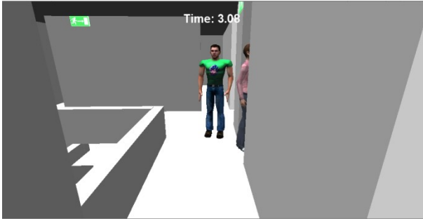
Figures 1: Gameplay example