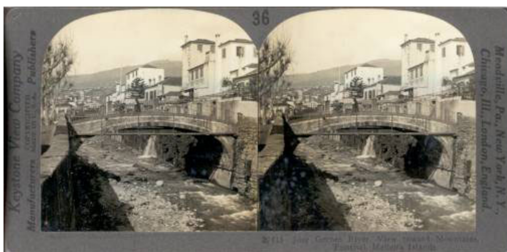
36 - Joor Gernes River, View toward Mountains, Funchal, Madeira Islands. - 27613