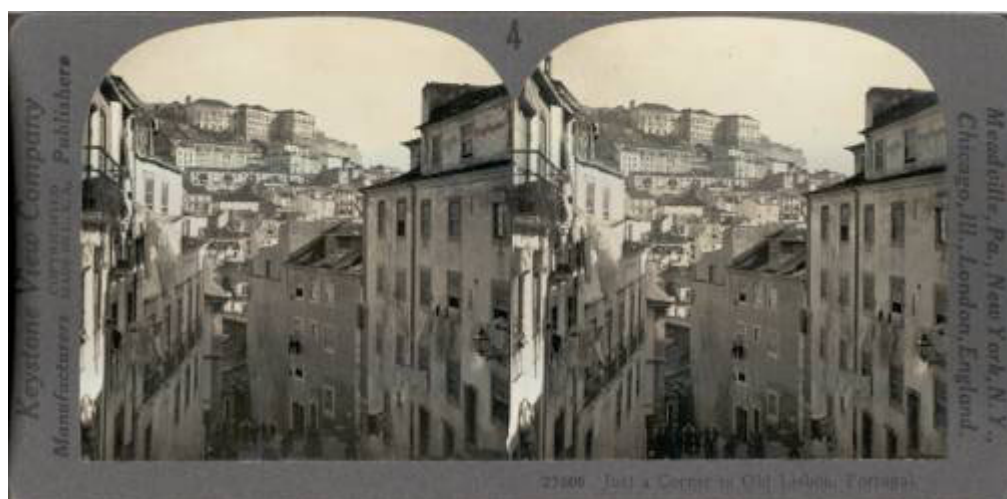
4 - Just a Corner in Old Lisbon, Portugal. - 27606. This same view was also published by B. W. Kilburn with the same caption (reference number 15254).