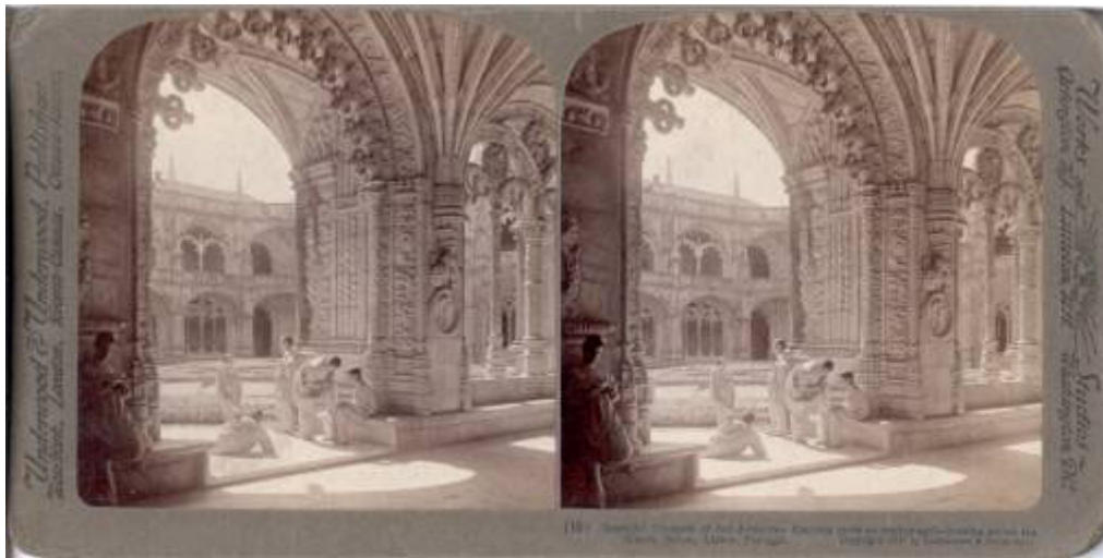
19 - Beautiful Cloisters of Sao Jeronymo Convent (now an orphanage) - looking across the Court, Belem, Lisbon, Portugal. (this variant retains the same caption but uses a different image)