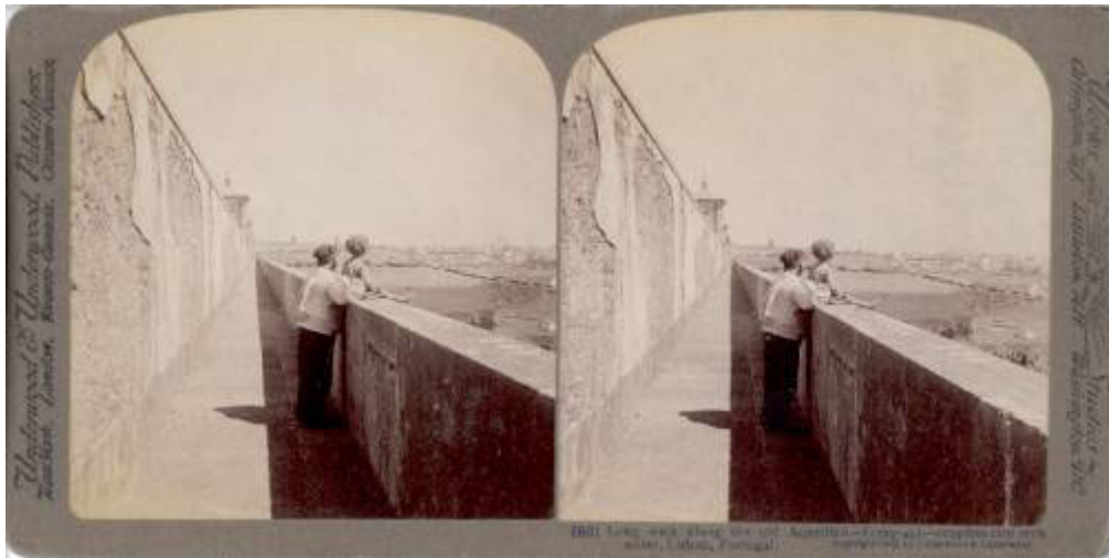
60 - Long walk along the old Aqueduct - (1729-49) - supplies city with water, Lisbon, Portugal. - Copyright 1902 by Underwood and Underwood.