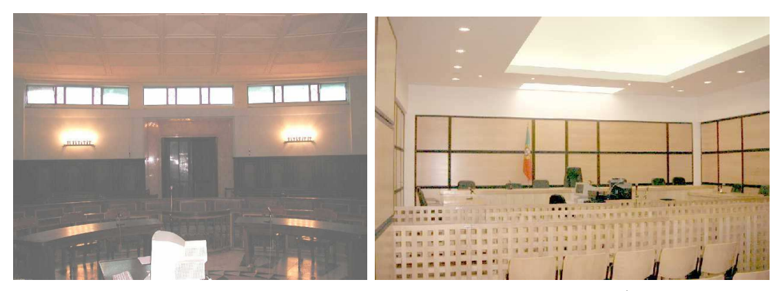
Figures 3 and 4: Examples of Courtrooms (Covilhã and Seia)<sup>1</sup>