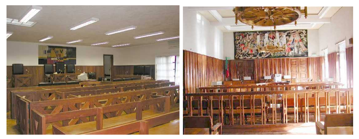
Figures 1 and 2: Examples of Courtrooms (Vouzela and Celorico da Beira)<sup>1</sup>

The above described multi-criteria method was used with a sample of 28 courtrooms<sup>1</sup> in Portugal that are described in Table 6 (with four examples shown in Figures 1 to 4).