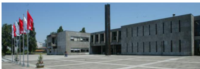
FEP - Faculdade de Economia da Universidade do Porto Rua Dr. Roberto Frias, s/n, 4200-464 Porto, Portugal