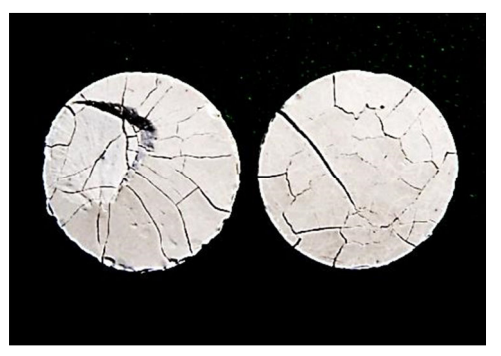
Fig. 1 - Degradation of ceramics based on zirconia in condition T=250°C.

It is known that tetragonal zirconia has a significant disadvantage, namely the property of degradation under hydrothermal conditions in the temperature range 120-300°C with a change in the phase composition, which can lead to the destruction of the material (Figure 1). This is due to a substantial increase in the amount of monoclinic phase, the specific volume of which is greater than the tetragonal phase (Danilenko, 2014) ( V_m > V_t \approx 4\% ).