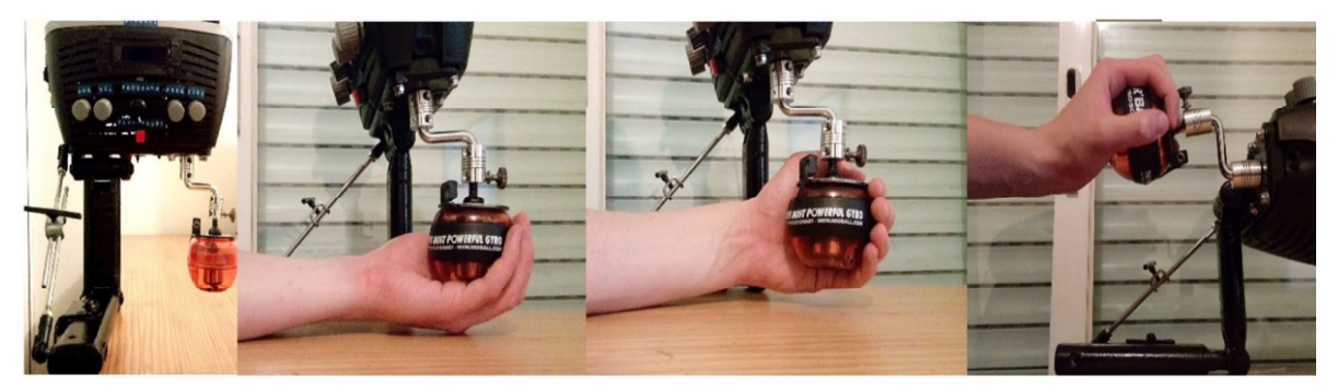
Fig. 1 - The Bioball and possible rehabilitation exercises capable to be performed on this device

created in LabVIEW (by National Instruments<sup>TM</sup>). The validation of this device was accomplished by physiotherapists at the Hospital of Braga, based on their own experience in the rehabilitation of patients with wrist pathologies (Ferreira, 2017).