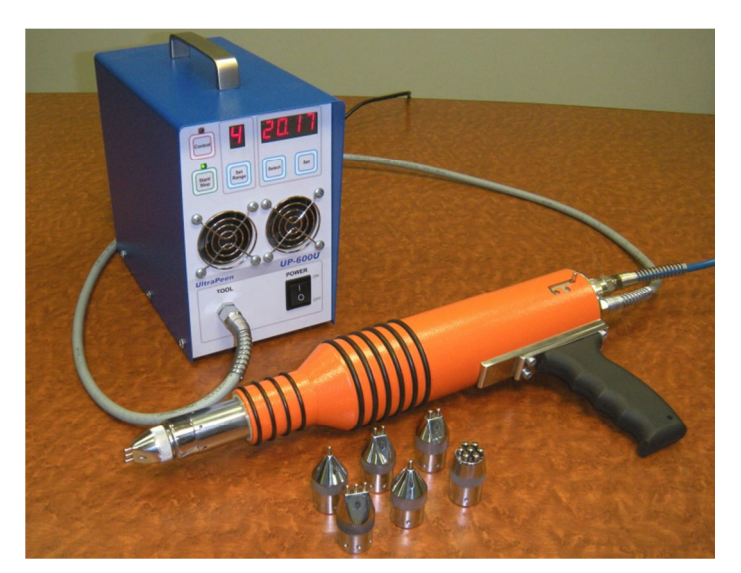
Fig. 1 - Ultrasonic impact treatment system for fatigue improvement of welded elements and structures

The UIT/UP technique is based on the combined effect of high frequency impacts of special strikers and ultrasonic oscillations in treated material (Kudryavtsev, 2008). The beneficial effect of UIT/UP is achieved mainly by relieving of harmful tensile residual stresses and introducing of compressive residual stresses into surface layers of material (Kudryavtsev, 1989) and also on smaller scale by decreasing of stress concentration in weld toe zones and enhancement of mechanical properties of the surface layers of the material. The basic system for UIT/UP treatment (total weight - 11 kg) is shown in Figure 1.