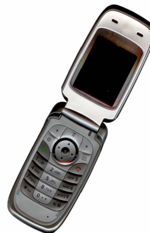
Fig. 3 Example of an image with acceptable resolution