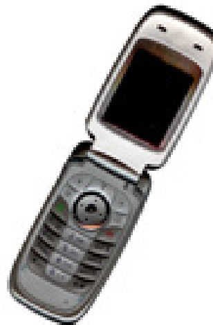
Fig. 2 Example of an unacceptable low-resolution image

must be placed after their associated figures, as shown in Fig. 1.